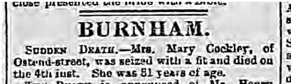
Image of the newspaper obituary